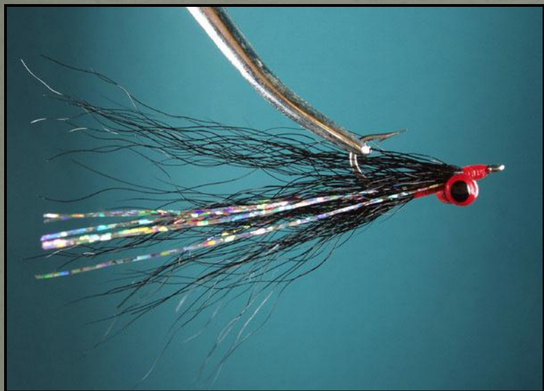
Death to Crappie: size six Clouser minnow variation